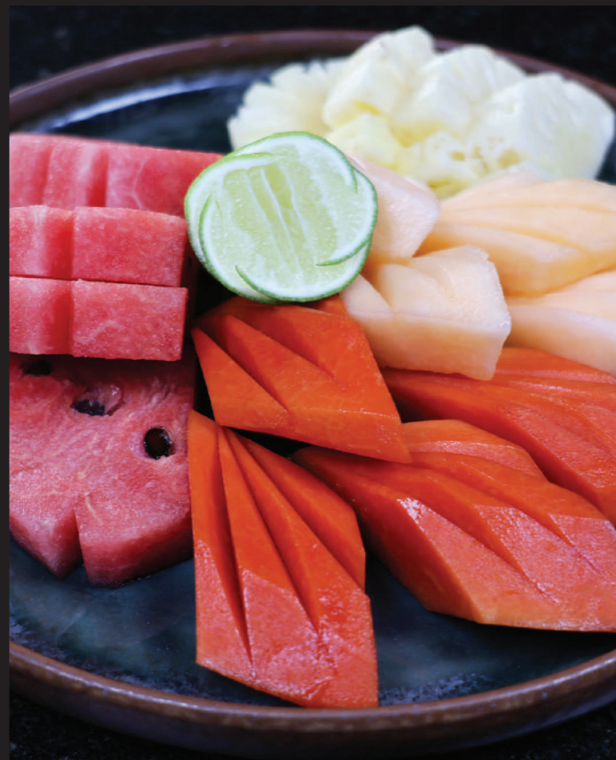
Chilled tropical fruit 200.- Mixed fruit slice in seasonal