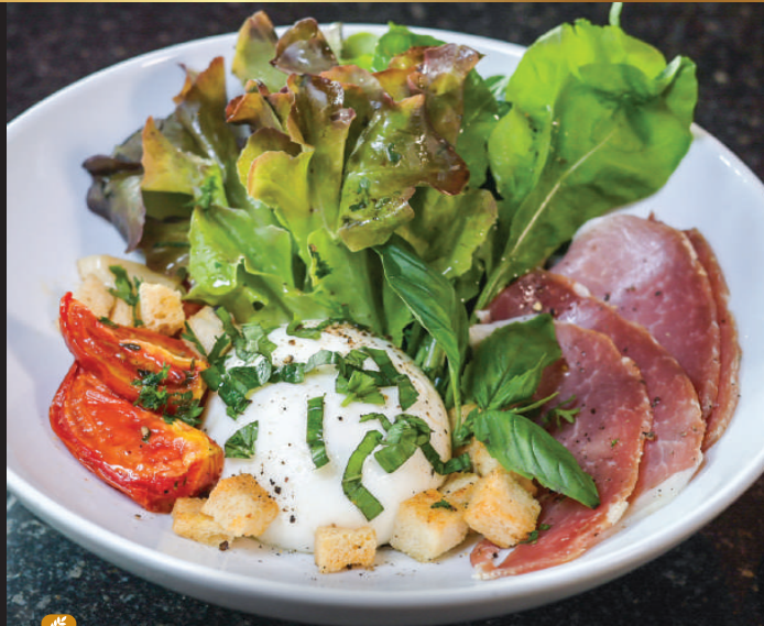
Burrata cheese & Parma ham 380.- Served with Rocket leaves, Sundried tomato, Black olive, Extra olive oil and Balsamic reduction