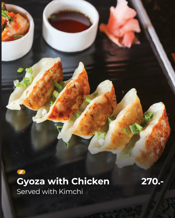
Gyoza with Chicken 270.- Served with Kimchi