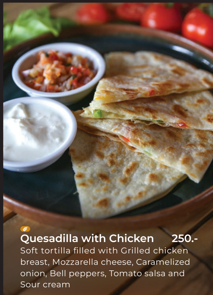
Quesadilla with Chicken 250.- Soft tortilla filled with Grilled chicken breast, Mozzarella cheese, Caramelized onion, Bell peppers, Tomato salsa and Sour cream