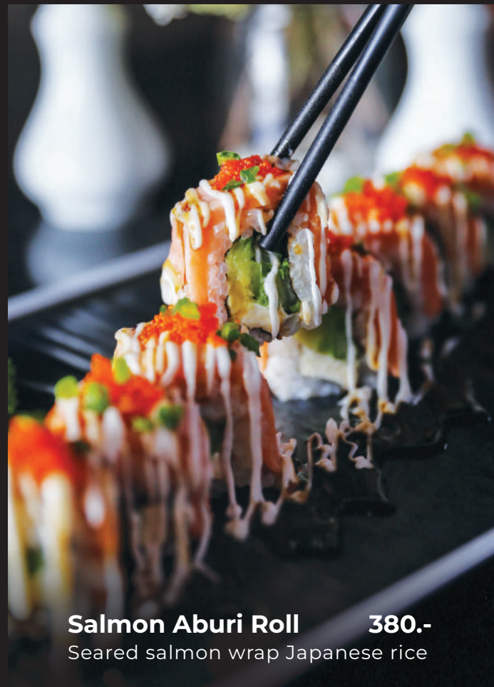
Salmon Aburi Roll 380.- Seared salmon wrap Japanese rice