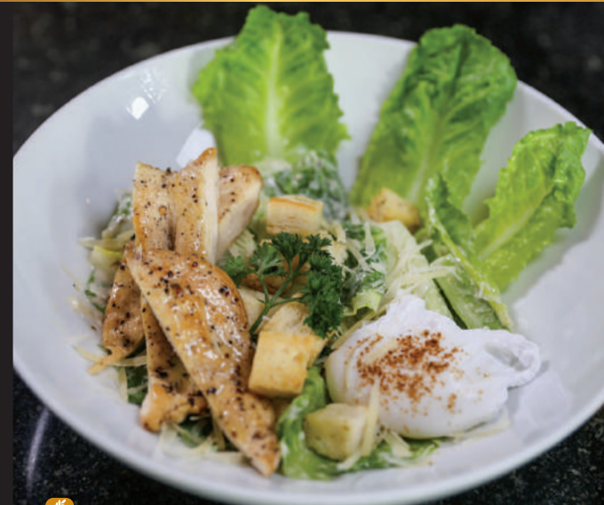
Chicken Caesar Salad 280.- Romaine lettuce, Parmesan, Croutons, Bacon poached egg and Caesar sauce