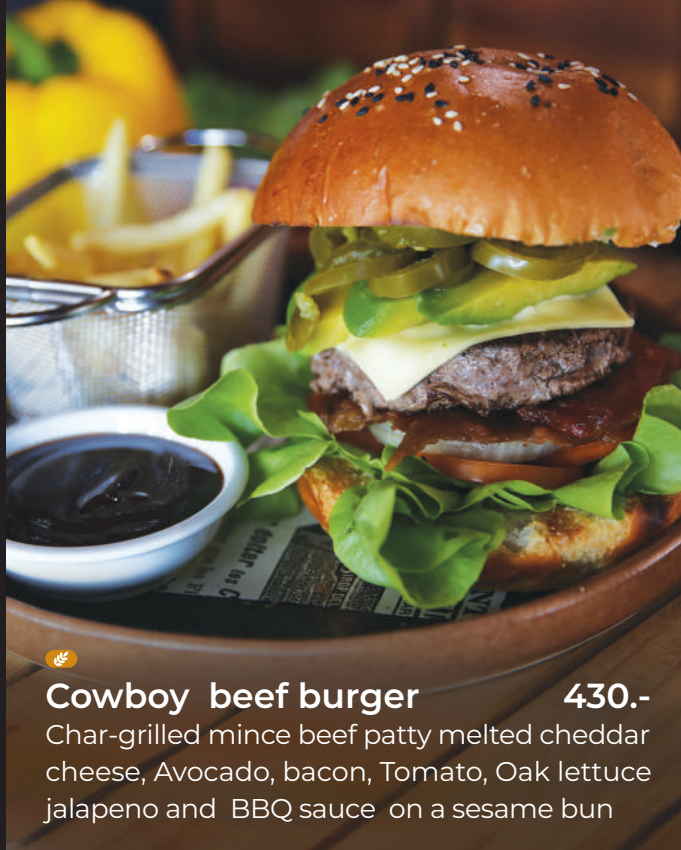
Cowboy beef burger 430.- Char-grilled mince beef patty melted cheddar cheese, Avocado, bacon, Tomato, Oak lettuce jalapeno and BBQ sauce on a sesame bun