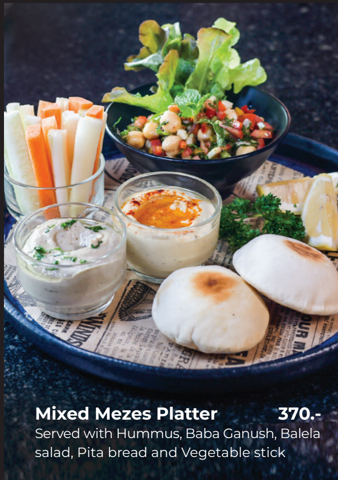
Mixed Mezes Platter 370.- Served with Hummus, Baba Ganoush, Balela salad, Pita bread and Vegetable stick