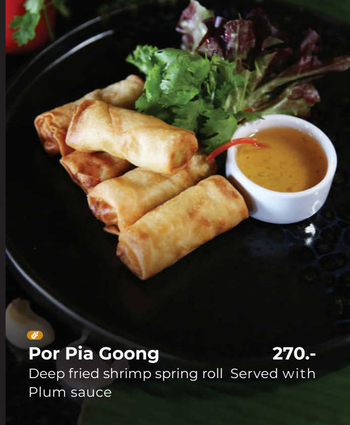
Por Pia Goong 270.- Deep fried shrimp spring roll Served with Plum sauce