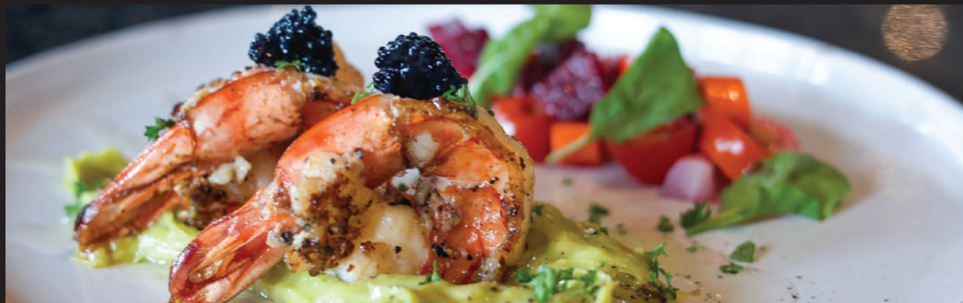
Prawns & Avocado 360.- Grilled marinated tiger prawns served with Lumpfish roe tomato & Beet root salad and Vinaigrette dressing