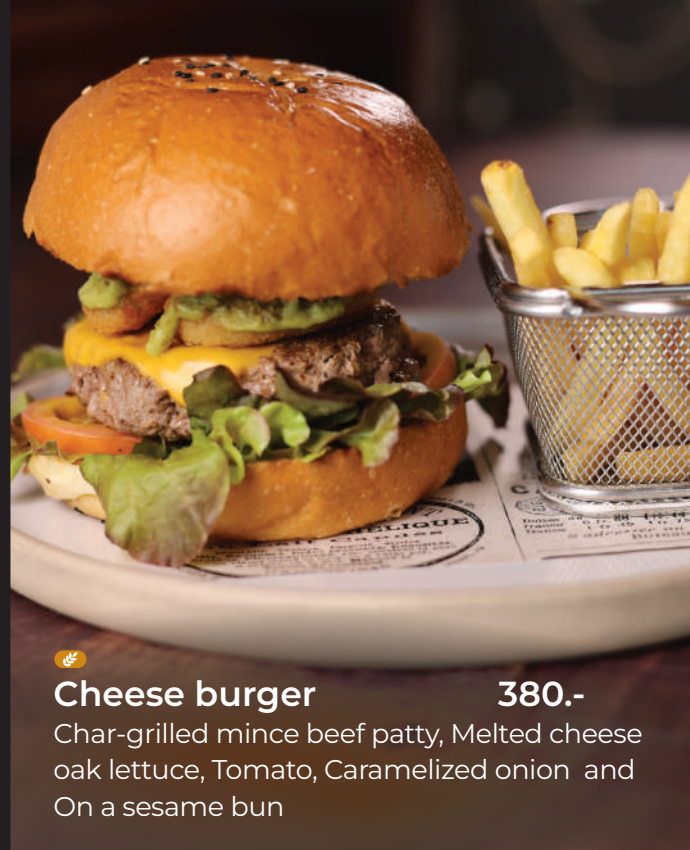
Cheese burger 380.- Char-grilled mince beef patty, Melted cheese oak lettuce, Tomato, Caramelized onion and On a sesame bun