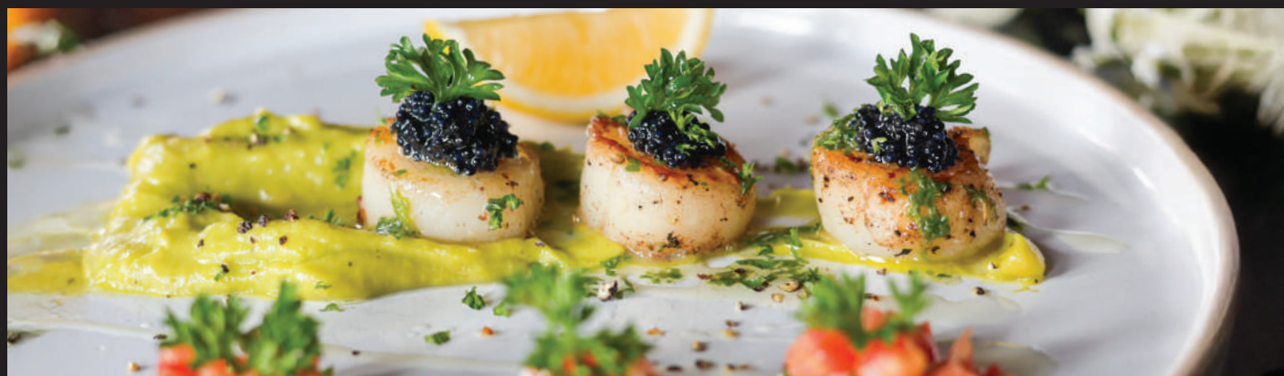
Seared Us Scallop 360.- Served with Avocado puree, Lumpfish roe, Tomato salsa & Rocket leaves oil