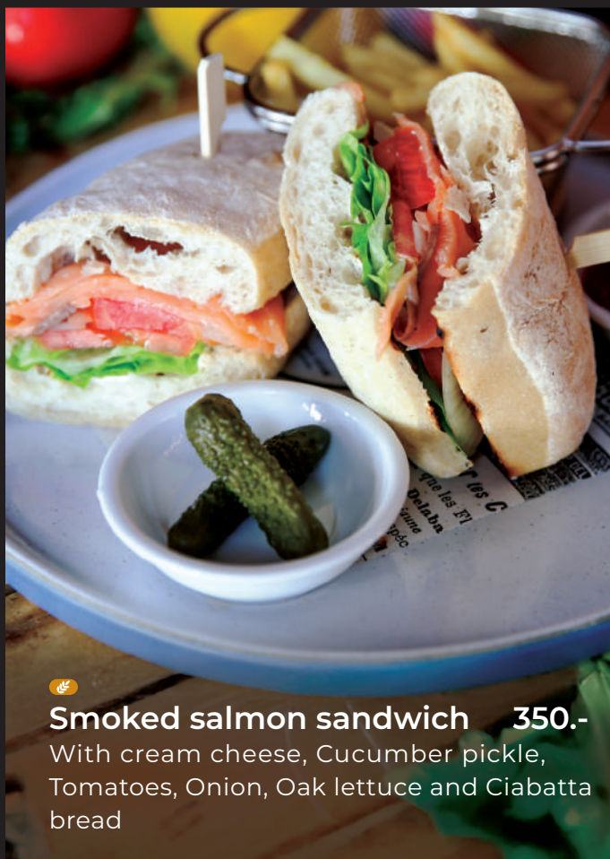
Smoked salmon sandwich 350.- With cream cheese, Cucumber pickle, Tomatoes, Onion, Oak lettuce and Ciabatta bread